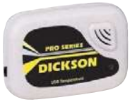
SP125 Self Contained Temperature