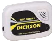
TP125 Temperature & Humidity