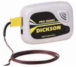
SP175 Remote K-Thermocouple Temperature